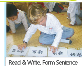
Read & Write. Form Sentence

The workshops focus on help children develop language skills in terms of speaking, listening, reading, and writing . Children will learn Chinese Poetry, Nursery Rhymes, and Speech expression .