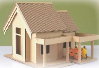
Design & Build your own house