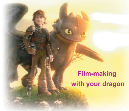
Film-making with your dragon

soccer, basketball, dodgeball, badminton, rock climbing, etc